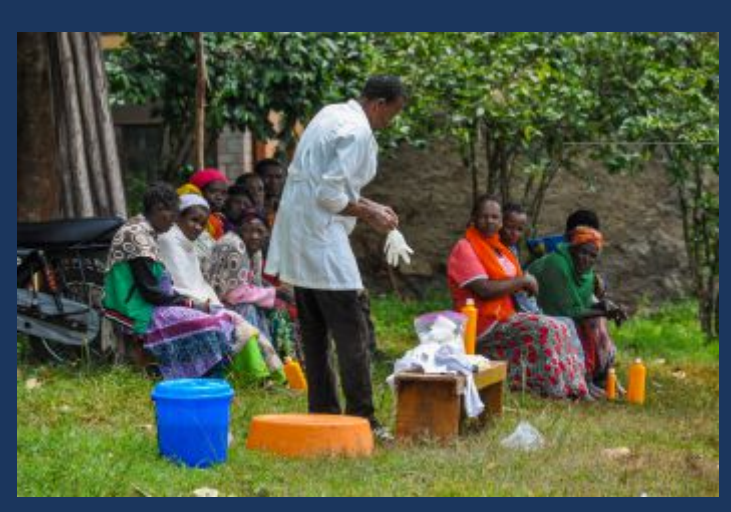
£7 million grant will boost research into "ignored" diseases

The <u>Global Health Research Unit</u> at Brighton and Sussex Medical School (BSMS), which works on some of the most 'ignored' neglected tropical diseases (NTDs), has been given a boost by an award of £7 million funding over five years by the National Institute for Health Research (NIHR).