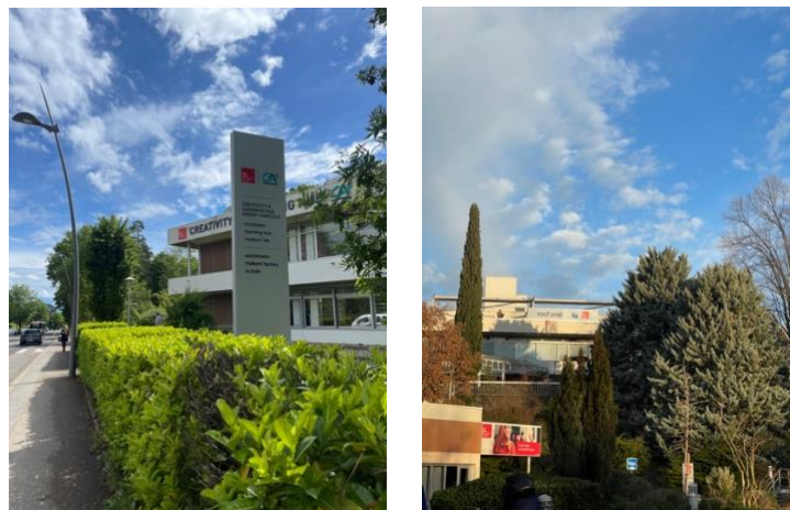
EmLyon Business School

Emlyon Business School stands out for its focus on entrepreneurship, innovation, and global perspectives. The school environment is markedly different from what I was accustomed to in Asia. The classrooms are smaller, promoting a more intimate and engaging learning experience. This setting fosters a strong sense of community among students and encourages active participation and collaboration.