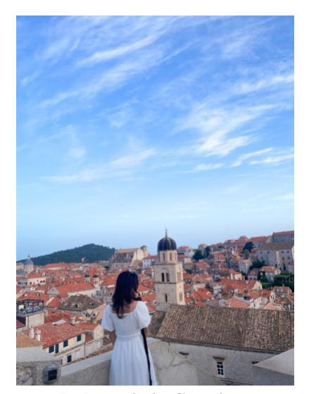
Dubrovnik in Croatia