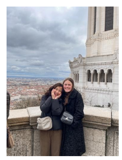
Basilica of Notre-Dame de Fourvière, Lyon

In conclusion, my time as an exchange student in Lyon has been a cultural adventure like no other. The city's museums and historical sites, combined with the ease of traveling to other European destinations, have provided me with a wealth of unforgettable experiences. Visiting these cultural landmarks has not only enriched my academic journey but also deepened my appreciation for the diverse and vibrant heritage of Europe. As I reflect on my travels, I am grateful for the opportunity to explore, learn, and connect with people from all over the world through the shared love of art and history.