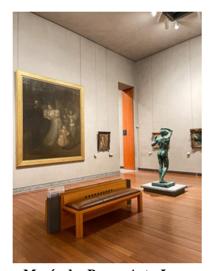
Musée des Beaux-Arts, Lyon

Lyon is home to many fascinating museums that showcase its rich history and cultural heritage. One of my favorites is the Musée des Beaux-Arts, often referred to as the "Little Louvre." It houses an impressive collection of art, spanning from ancient Egypt to modern times. Wandering through its halls, I was captivated by works from renowned artists like Rubens, Rembrandt, and Monet. The museum's beautiful courtyard and gardens provide a peaceful escape, making it a perfect spot for reflection and inspiration.