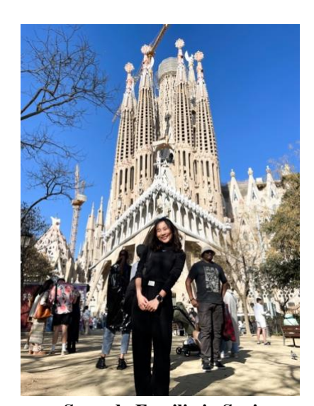
Sagrada Familia in Spain

Lyon itself is rich with history, from its Roman amphitheater to the stunning Basilica of Notre-Dame de Fourvière. Exploring these sites has given me a greater appreciation for the city's historical significance and architectural beauty. The vibrant cultural scene in Lyon, with its numerous festivals, theaters, and music venues, has added an extra layer of excitement to my stay.