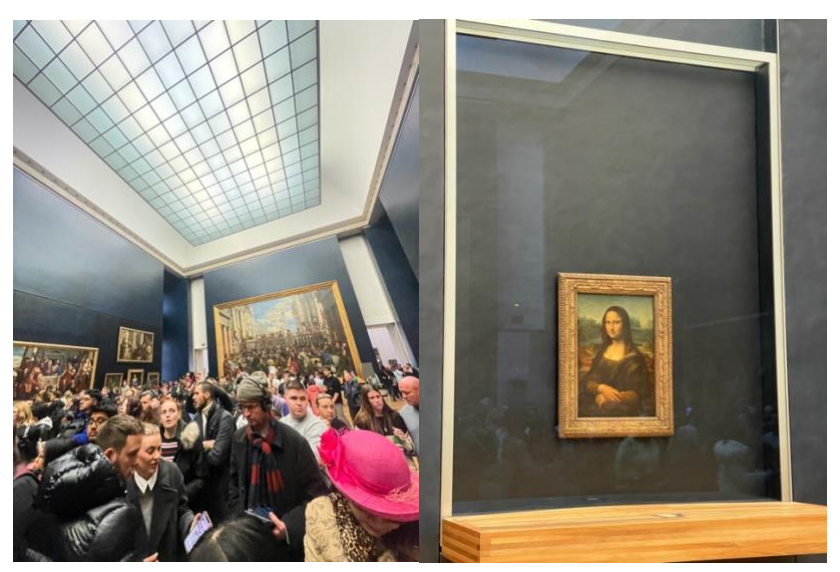
Musée du Louvre, Paris

masterpieces like the Mona Lisa and the Venus de Milo drawing visitors from all corners of the globe. On my second visit, I took my time exploring the less crowded sections, discovering hidden gems and gaining a deeper appreciation for the vast array of art and history housed within its walls.