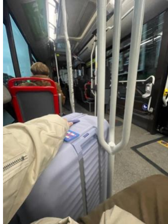
Bus in Lyon

Transportation in Lyon was efficient, with buses, trams, and the TGV train connecting various parts of the city and beyond. Lyon's public transportation system is well-organized, with student discounts available for those under 26, making it affordable to navigate the city. I often used the bus for my daily commute and inter-city travel, finding it both convenient and cost-effective.