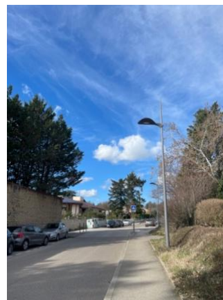
Écully Town, on the way to school