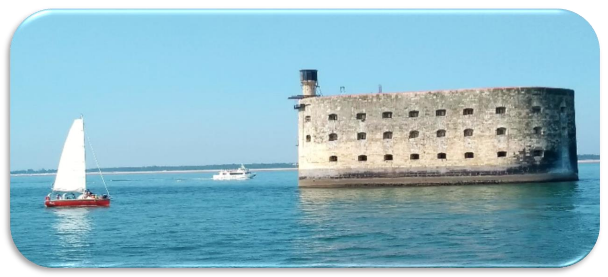
Fort Boyard, part of La Rochelle history