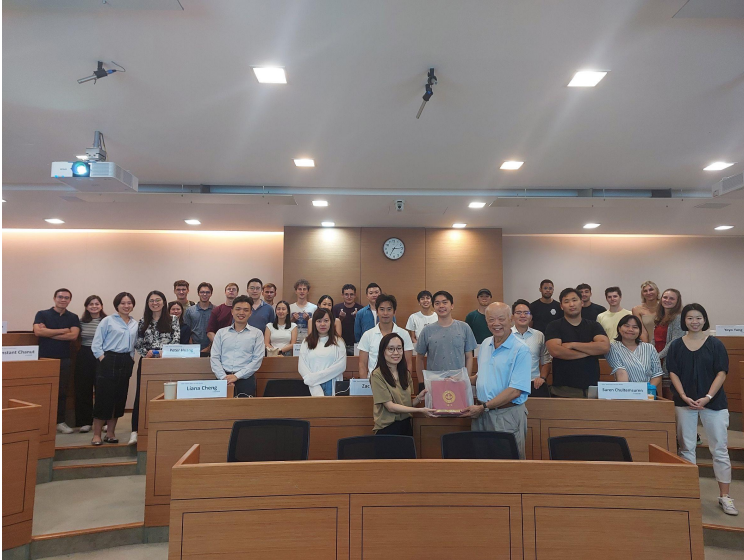
Special Topics on Profit Models class with a gift for Professor (27 Sep 2023)