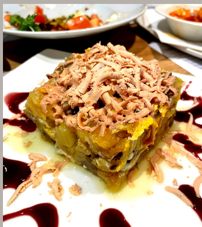
RESTAURANT / TAPAS