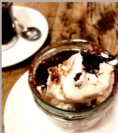
BRUNCH / EASY BITE