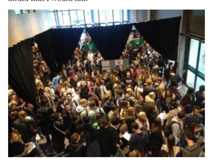
(tons of people waiting to get in the hall)

On the exam day, you can smell there's panic in the air... everyone is nervous especially the exchange students I think. I didn't know how it will be and afraid that I would fail.