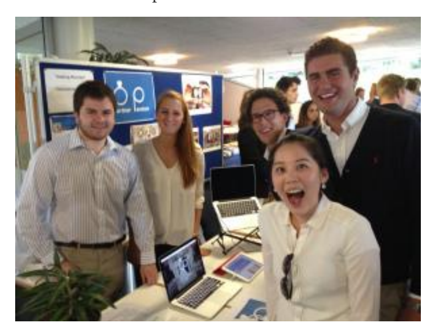
(Team Partner Pension at the final event )

We have to help a pension fund to create awareness of pension, which is already said, a challenge! During the preparation it was actually very fun also time consuming. We had to meet with our team members frequently and think of marketing campaigns that are catchy. But it was worthy, we were announced second place!